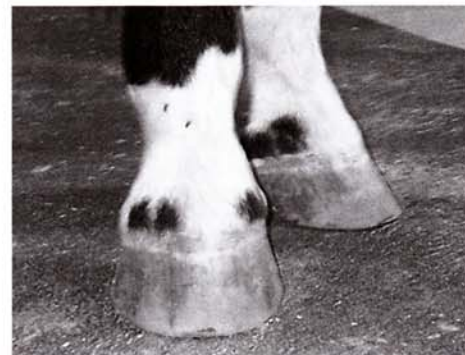
The Horse's Hoof, News for Barefoot Hoofcare