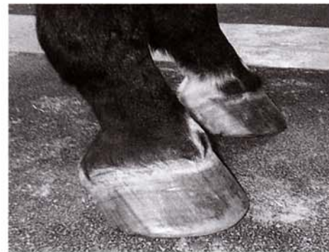
Gray's front (above) and hind (below) hooves. He's not missed a day of work since going barefoot in April, 2008.