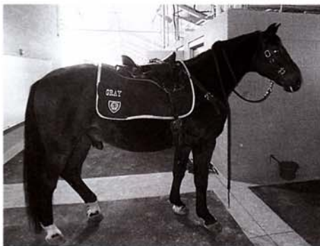
"Gray" is a 16.3 hand bay Hanoverian gelding who had never been lame, despite being shod most of his life.

The Houston Police Mounted patrol started using unshod, barefoot police horses in 2004. Starting with one horse and with each successful barefoot working police horse, we have since eliminated the use for metal shoes. In the early stages of 2004, I was the only Officer trimming the horses. I was generally given the frequently lame or "last chance" horses, and I personally had very little knowledge on the shod-to-barefoot transition process. There was very little if any long term turnout at our old 3 acre facility, and a feeding program that was not conducive to healthy hooves, with very little fiscal resources for hoof boots. At the beginning of our barefoot journey, each of the horses that had their shoes pulled were going through a lengthy and painful transition process; however, this gave us the opportunity to continue to learn and get better with each horse.